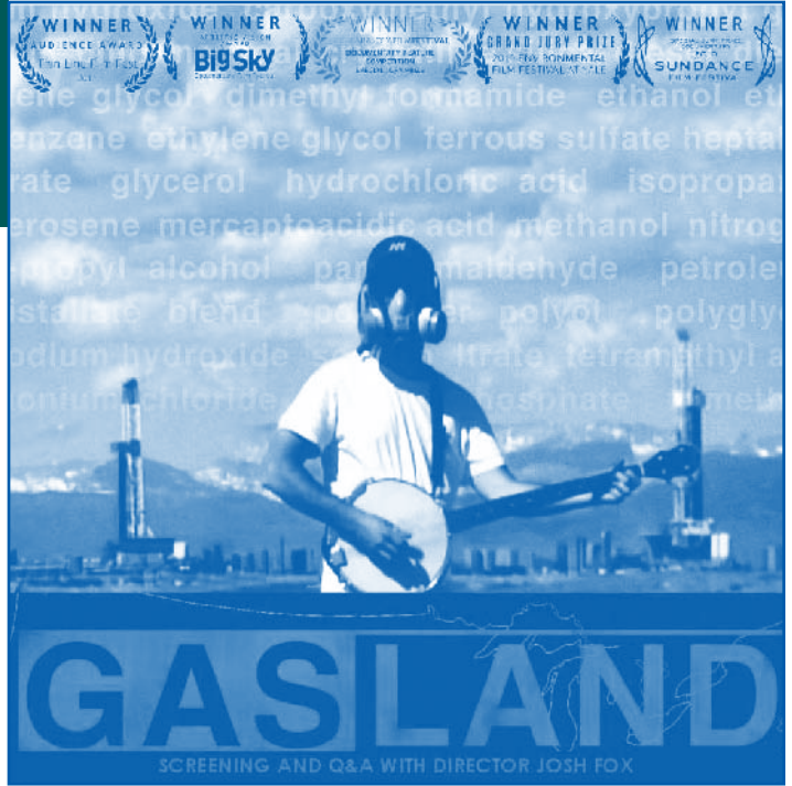
WVRC recently co-sponsored a showing of the award-winning documentary Gasland at West Virginia Wesleyan College.

Also on the national stage the FRAC Act (S.1215), sponsored by Senator Bob Casey (D), is moving through the legislative process. The Fracturing Responsibility and Awareness of Chemicals (FRAC) Act was written to amend the Safe Drinking Water Act in two ways: