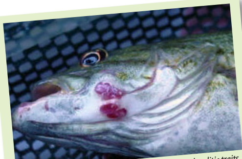
Potomac small mouth bass have exhibited hermaphroditic traits. In some areas 100% of fish tested were intersex.

In 2008, male small mouth bass in the Potomac were found with the beginnings of eggs in their reproductive organs. This alarming mutation is not confined to West Virginia. Fish and other aquatic wildlife around the world are showing mutations to their reproductive organs.