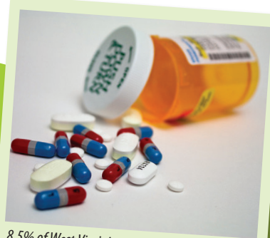
8.5% of West Virginian teens admit to abusing Rx medicines.

Prescription medications are the most widely abused substance excluding marijuana. The Mountain State has the nation's highest rate of drug-related deaths; between 2001 and 2008 more than 9 out of 10 of those deaths involved prescription medications. Drug overdoses now kill more West Virginians each year than car accidents. These startling statistics directly coincide with the availability of prescription medications to non-prescribed users.