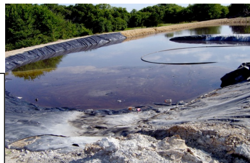
Figure 3: Saline crust forms around the edge of a lined pit used to hold and treat flow back water from hydrofracked well. Also, the far end of the pit does not seem to be lined above the water level.

What makes these chemicals even more dangerous is the fact that many of the chemicals and their concentrations are unknown. Companies producing the chemicals used are not required to report the content of their fracking fluids and formulas are considered proprietary information vital to the company’s success. There are 435 known chemical products used in the oil and gas industry. Many of these products contain chemicals that are extremely harmful to humans even in small concentrations. A 2002 Environmental Protection Agency (EPA) report cited that many fluids used in the fracturing process contained chemicals and concentrations that well exceeded drinking water standards ( WORC ). Accidents have been reported from well sites in which workers came in direct contact with some of the chemicals used in the fracking fluid. Reports of severe nausea, respiratory irritation, kidney, liver, and heart damage, and chemical burns and rashes are common symptoms among victims.