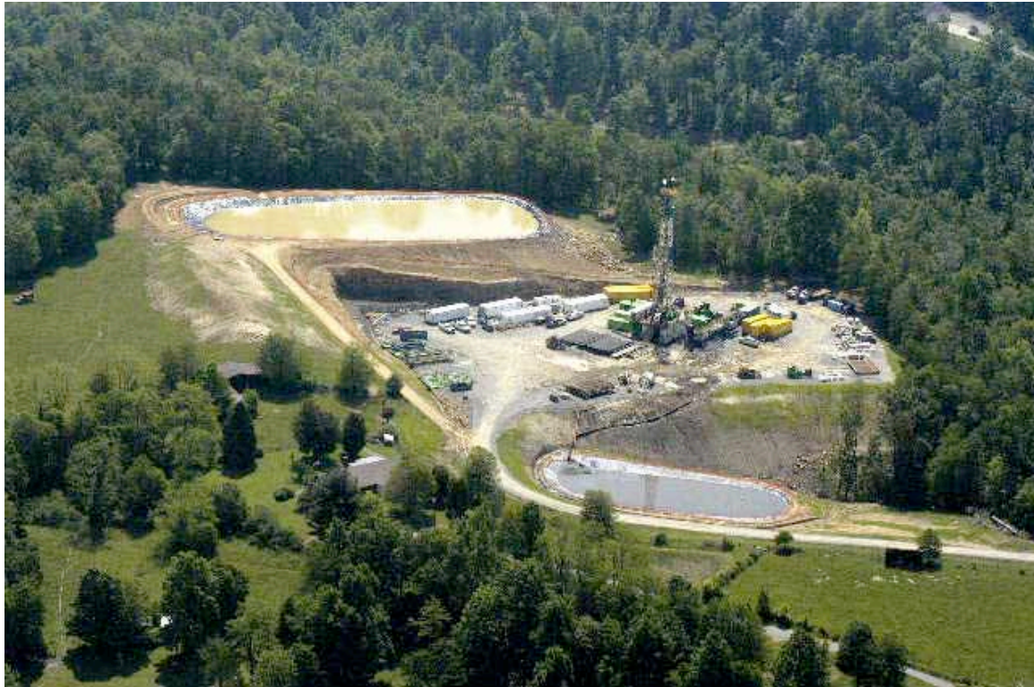
Picture of Marcellus well drill site in Upshur County, WV.